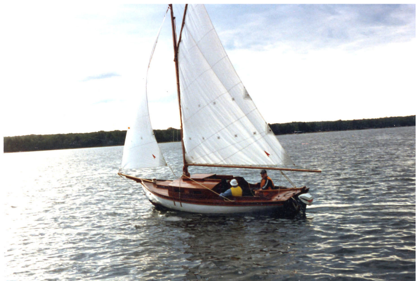
Ron's boat, Soft Shoal, on Otsego Lake