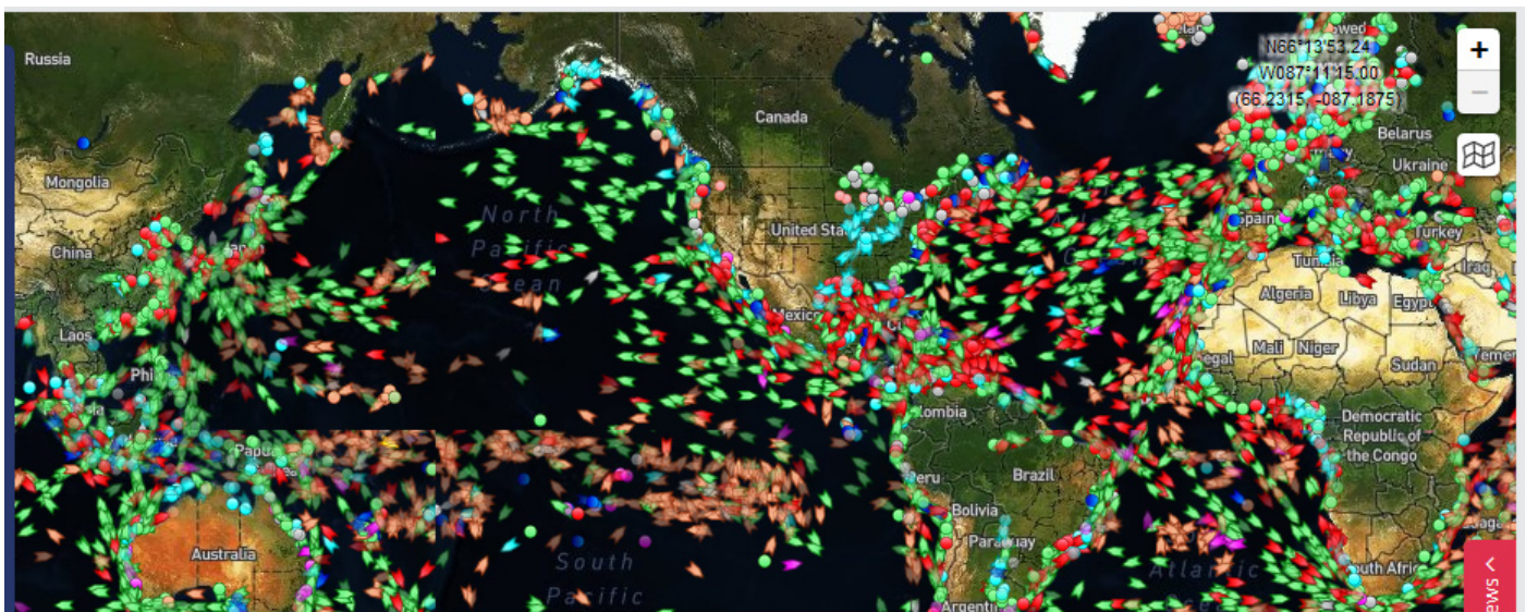
Recent (several hours) ships positions shown on the www.marinetraffic.com web site

November and December have seen heavy weather on Lake Superior with gale-force winds. This has required freighters to be "on the hook" or "to go to anchor" in several different anchorages. This activity can easily be followed on the marine traffic website. {editors note; this web site is fantastic. It has a map of the world with a symbol of each ship/boat position over several hours on the seas and navigable lakes and rivers on it, and the coordinates of your cursor and other info. It is a 'must see' web site}