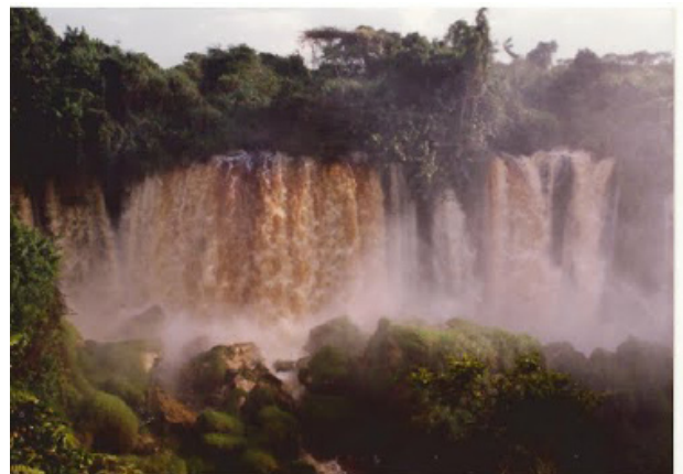
Chutes de la Lufuku à Kakobola