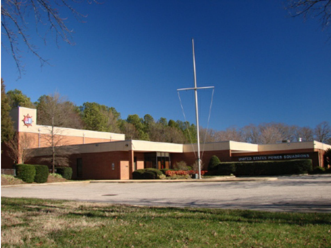
United States Power Squadrons Headquarters at 504 Blue Ridge Road, Raleigh N.C. 27607

Districts are numbered the same as Coastguard districts. Michigan is District 9 and contains all the squadrons in Michigan. USPS membership currently is about 21,000 in about 350 squadrons, but a few years ago it was over 60,000.