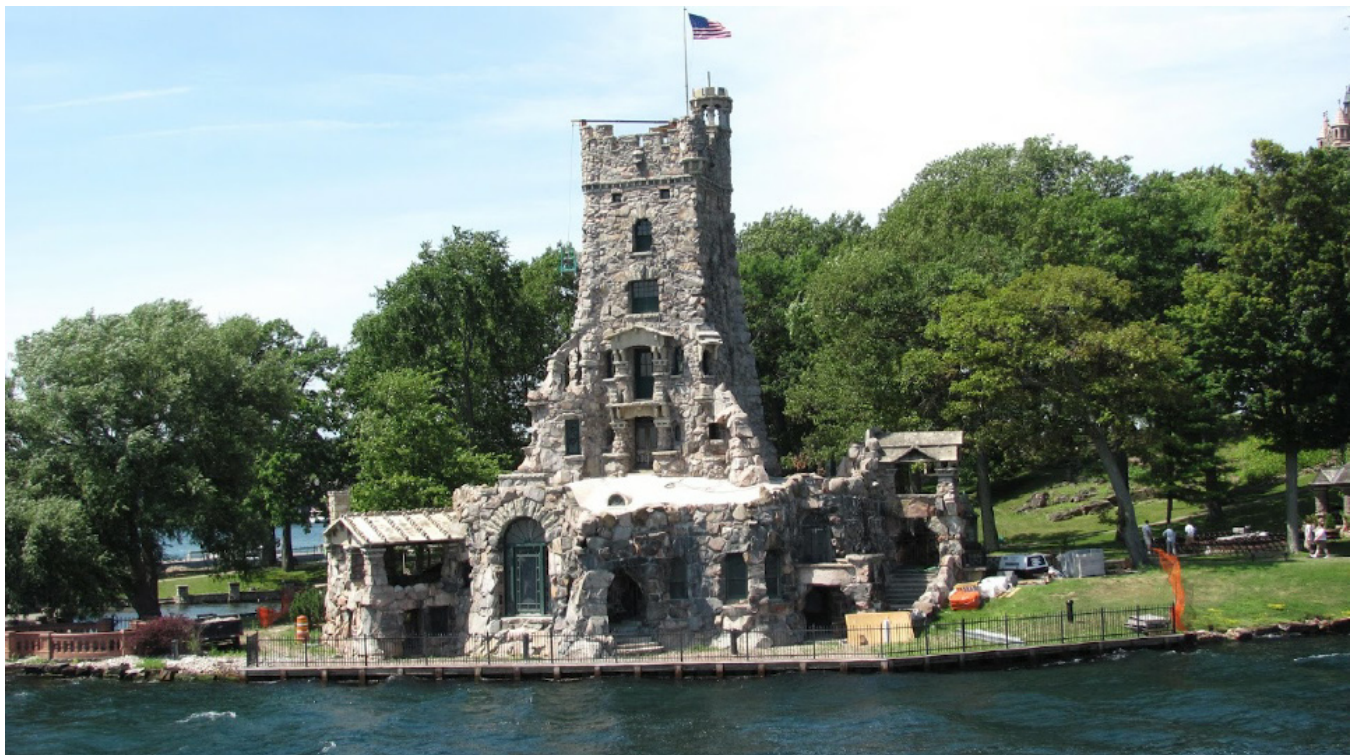
Boldt Castle