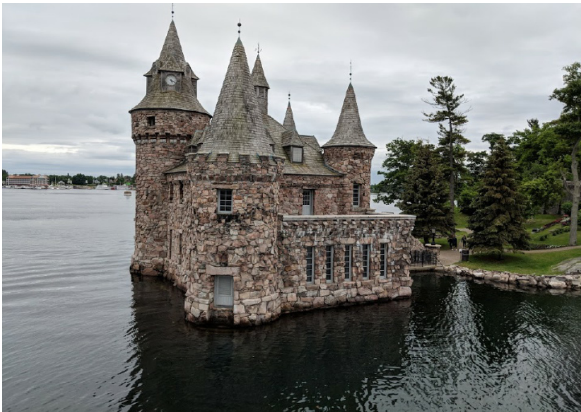
Home sweet home or Boat House in the Thousand Islands 44° 29.4' N 75° 48.3' W