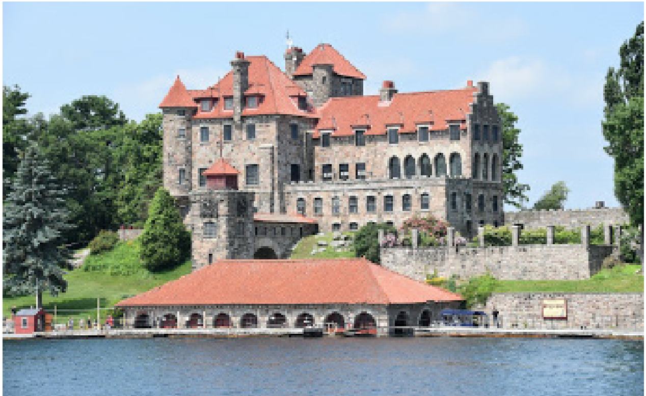
Singer Castle near Mallorytown, Ontario, Canada 44° 27.1' N 75° 48.7' W Photo by Theyre

Thousand islands' homes in the St. Lawrence River. Pictures from Google Earth