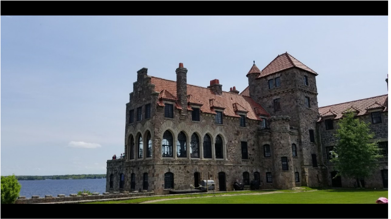
Singer Castle