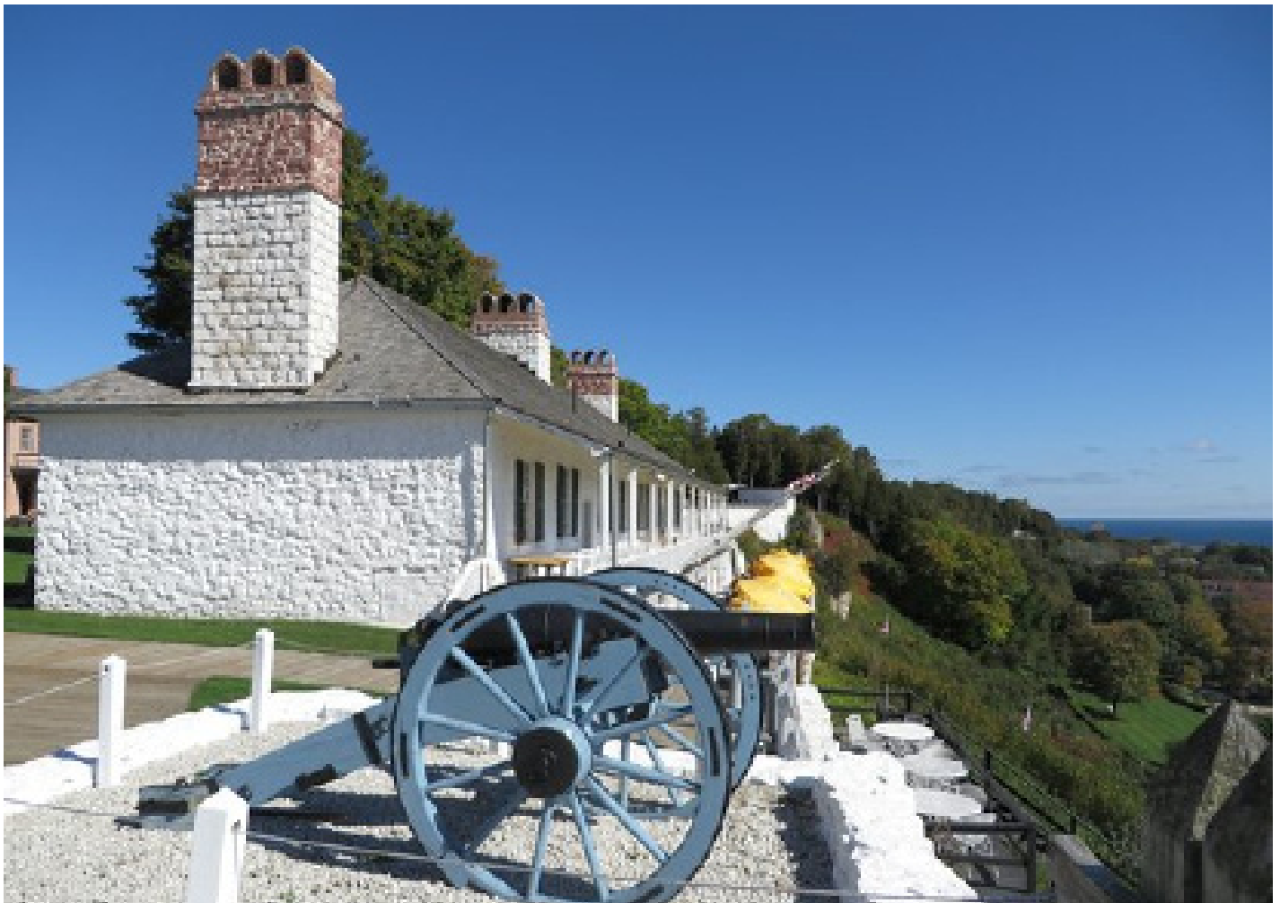
Fort on Mackinac Island

This month's Great Loop features are the Forts and museums in Mackinaw City, Mackinac Island, St. Ignace and Cedarville.