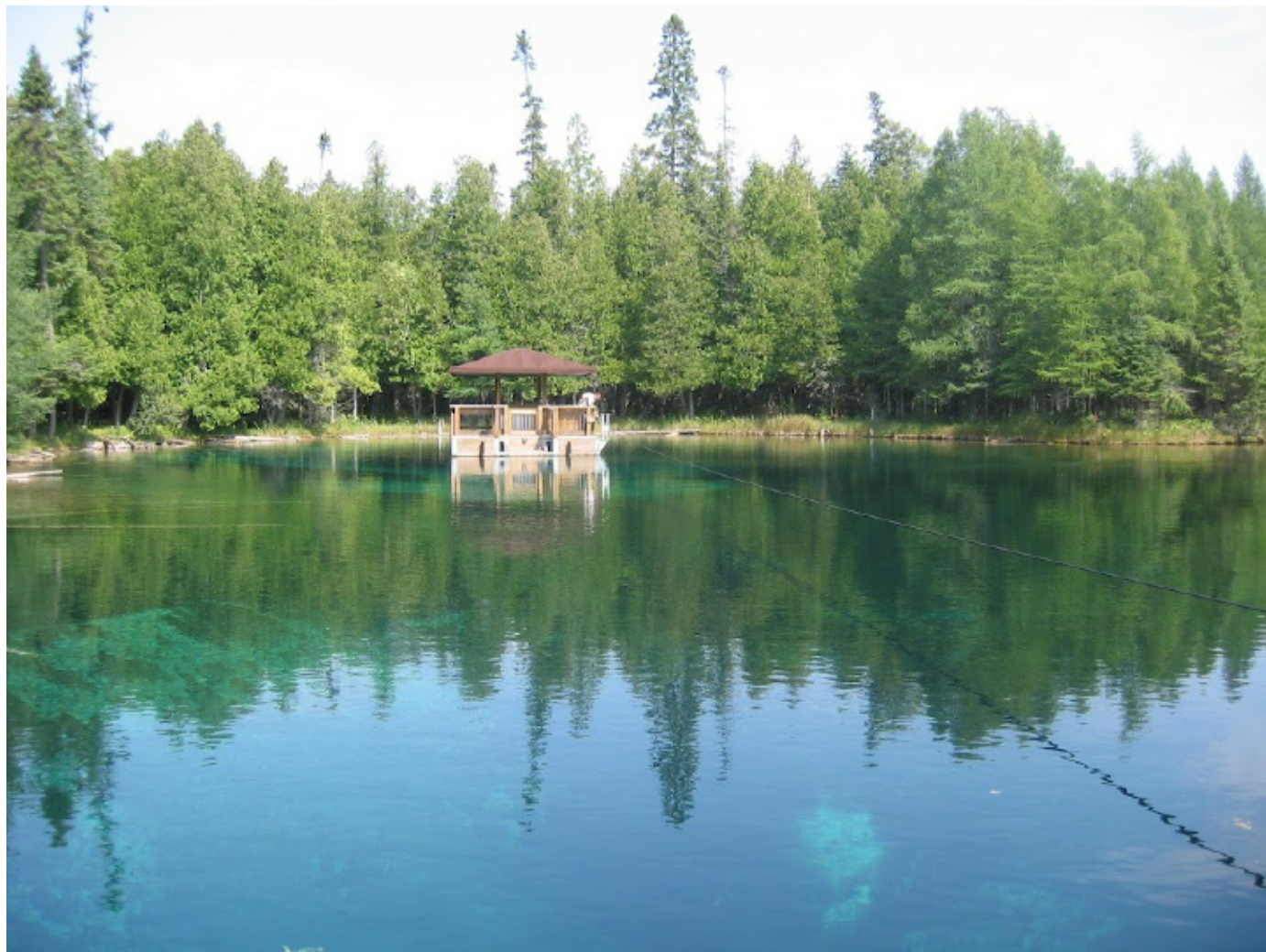
Palm Brook State Park Kitch-ita-kipi Big Spring L 46° 15.0' N Lo 86° 22.9'

Kitch-ita-Kipi Spring (Big Spring) in Palm Brook State Park is worth viewing. It is about 12 miles northwest of Manistique MI., near the northwest corner of Indian Lake. It has clear water 40' deep where you can see large fish swimming near the bottom.