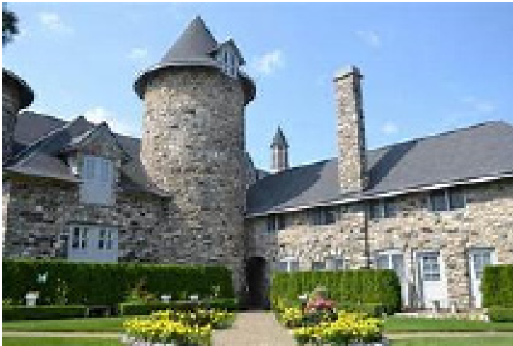
Castle Farms and winery in Charlevoix.

This small city in Northern Michigan has just been named one of the 15 best small towns to visit in 2021 by Smithsonian Magazine.