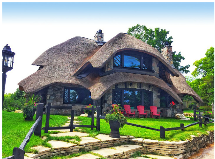
The Thatch House 45° 19' N 85° 16' W

5052 M-66 south of town 45° 16.8' N, 85° 13.8' W