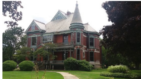
Ft. St. Joseph Museum in Niles located in the former carriage house of the beautiful Victorian period Chapin Mansion

Visit Fort Miami and Fort St. Joseph (1679 to 1781) and the museums in Niles Michigan. LaSalle, (French), British, American Indians and Spanish were each occupants in its history.