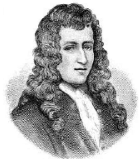
Portrait of René-Robert Cavelier, Sieur de La Salle, who built the first French settlement in northern Illinois