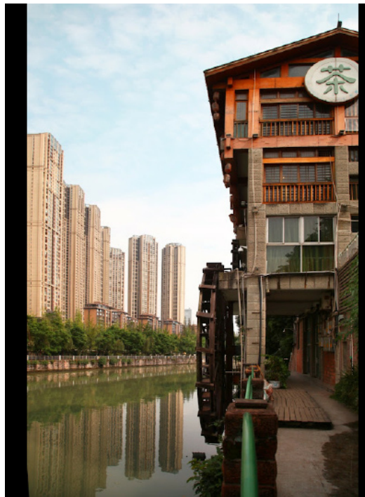
Jinjiang River in Sichuan, China