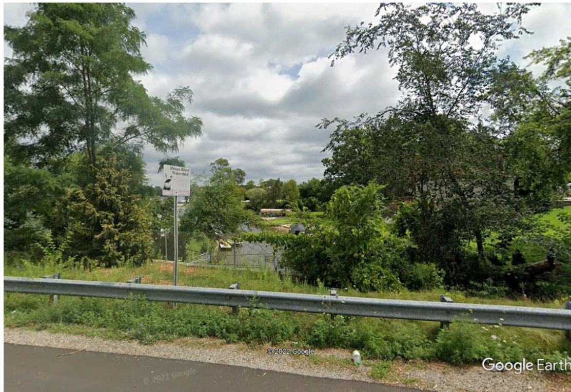
South Commerce Lake where the Huron River goes under Benstein Rd. toward Proud Lake

Indian Springs Metro Park and the Waterford region west of Pontiac have many springs and ponds feeding Pontiac Lake and eventually the Huron River, South Commerce Lake, under Benstein Road to Proud Lake State Park, and eventually to Milford, Dexter, Ann Arbor and to Lake Erie. In the same area, Cass Lake, Orchard Lake and a bunch of other lakes feed the Clinton River that goes into Pontiac, under South Mill Street in Pontiac, underground thru Pontiac near Huron Street along the Clinton River Trail, and east to Rochester, Utica, Mt. Clemens and into Lake St Clair. So both the Huron River and the Clinton River start a few miles west of Pontiac.