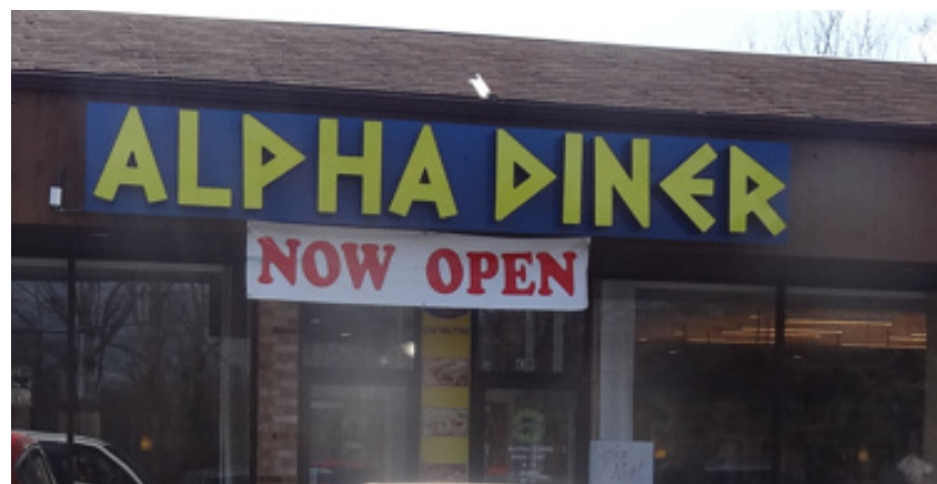
Alpha Koney Diner

Visual Passage Planner (VPP) route thru the Magellan Straits