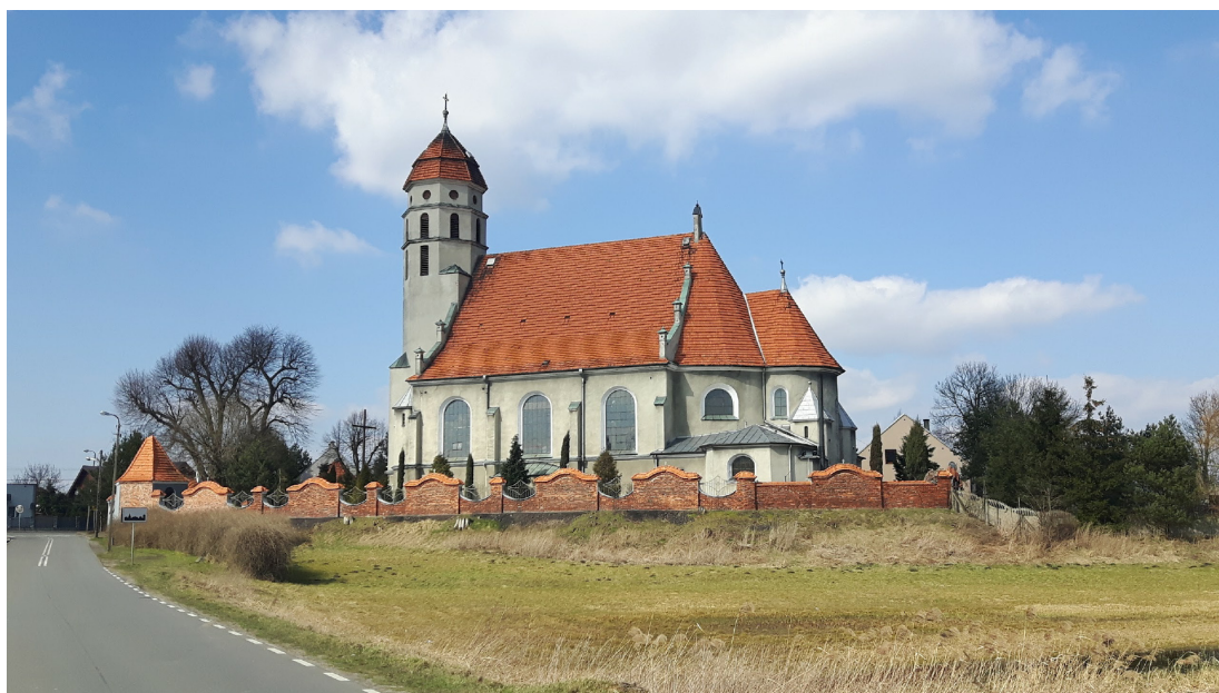
Old Church in Debe Poland.