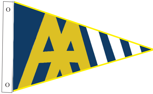
Sail and Power Boating Education