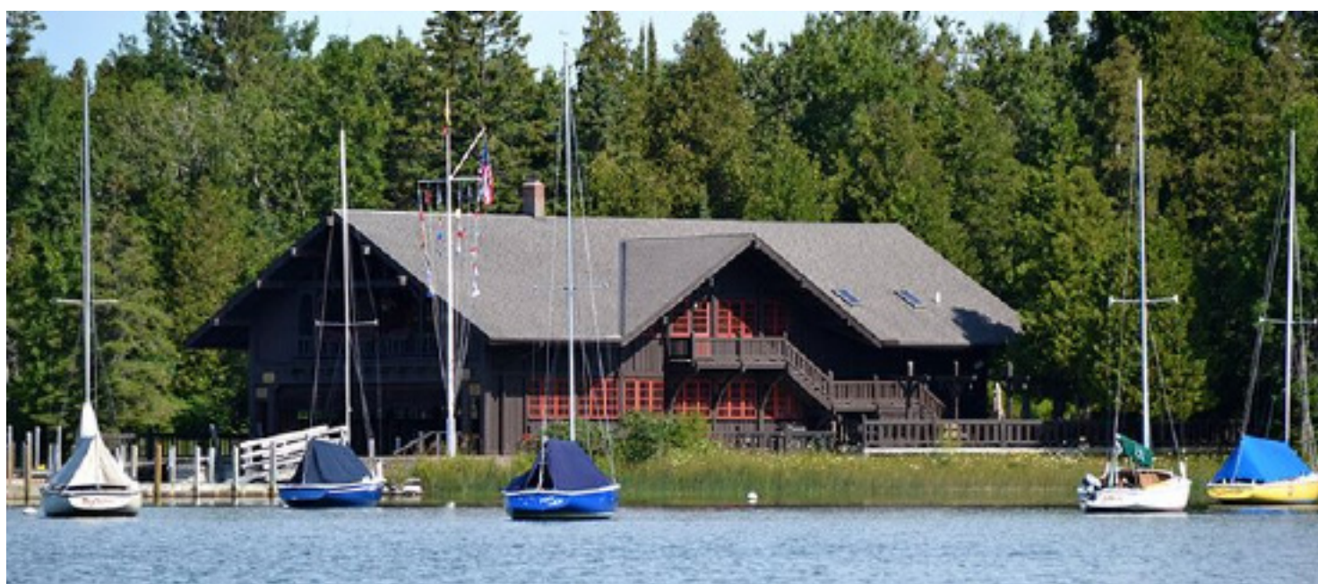
Les Cheneaux Yacht Club

You can google the yacht club to see pictures of the club and area near by. Use free OpenCPN digital charts for navigation.