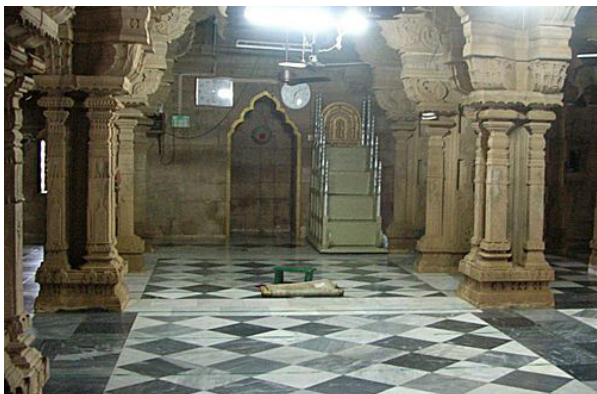
India pictures from Google Earth