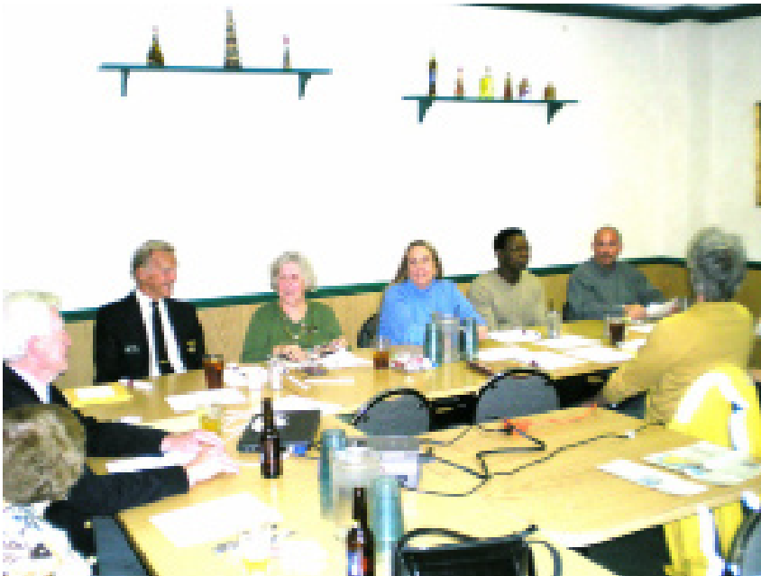
March General Meeting.

Almost all of the students accepted our invitation to join USPS utilizing the 6 month free membership available to students who have completed the course. Our challenge as a squadron is to encourage them to become active in AASPS so that they will continue as viable members. I believe that we can accomplish this by presenting interesting programs and being "The Friendly Squadron."