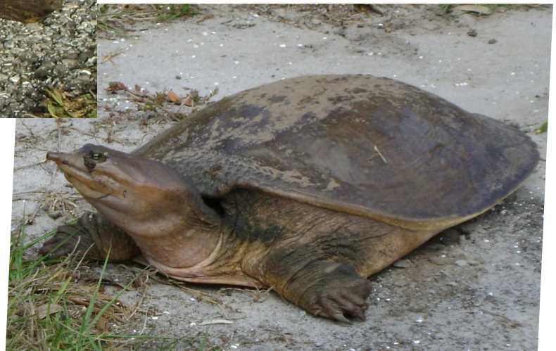
Soft Shelled turtle

Editors comment: From now on others will think of us as the "Turtle Squadron"!