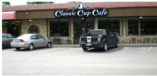
Classic Cup Café