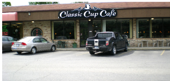
Classic Cup Café