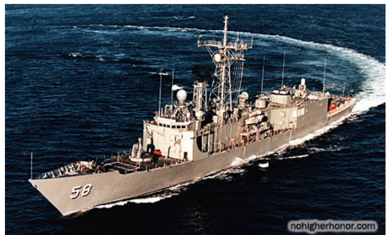
USS SAMUEL B ROBERTS