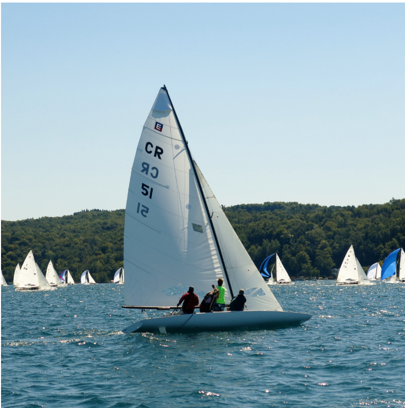
Hiking out on the beat