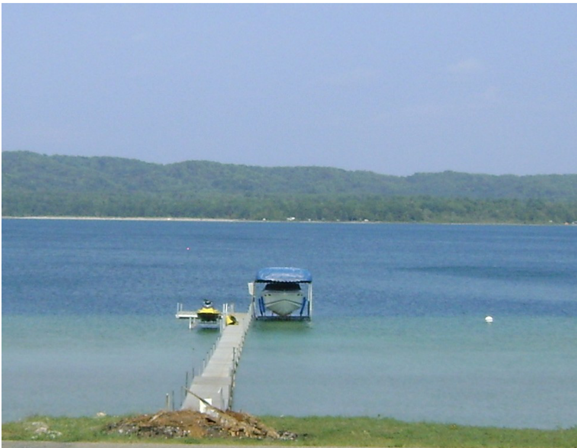
Friend's dock on Lake Charlevoix

I wish to thank all the members of our squadron for contributing to the squadron in whatever way they choose. I hope to see everyone at the dinner meeting on October 20th.