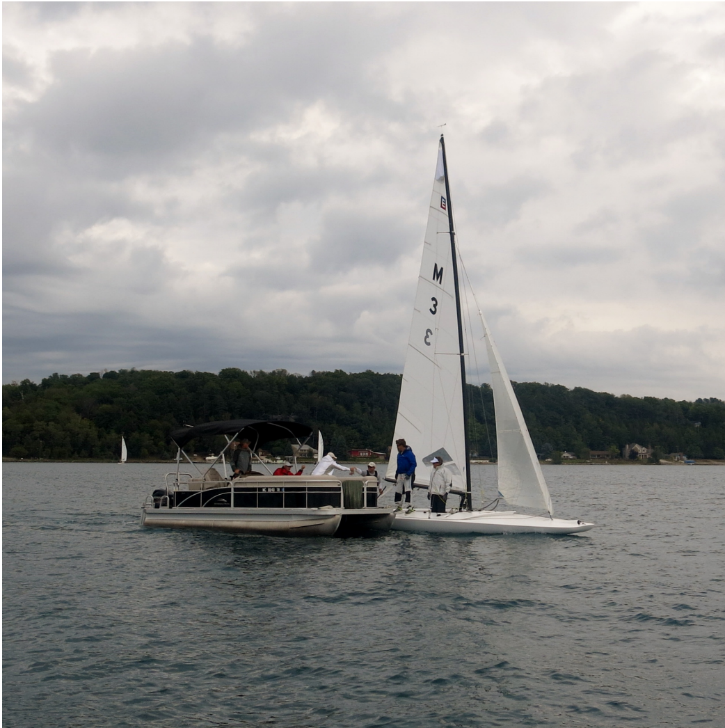
Crystal Lake near Frankfort Michigan, Scow racing