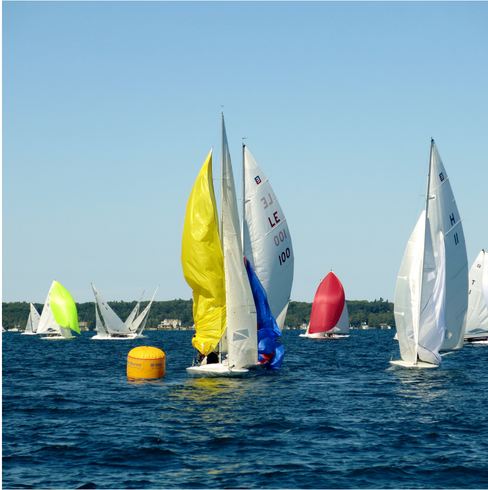
Spinaker work at the turn.