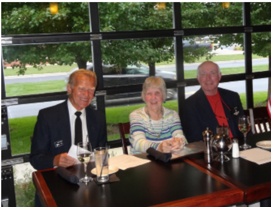
Ann Arbor Sail and Power Squadron First Fall Meeting, September 15, 2014

At the next meeting, we need to talk briefly about the date of the Christmas Party. Holidays seem like a distance away; the leaves are just starting to turn. However, the holiday time can be busy with concerts, travel, and family visits, so the October meeting would be a good time to think about a date.