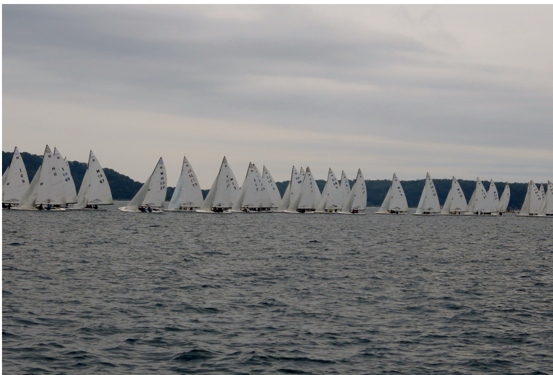
Scows racing on Crystal Lake