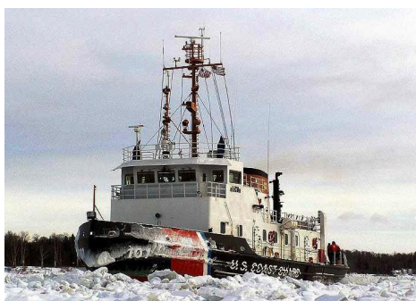
Mobile Bay breaking ice on the St. Clair river

The sudden arrival of really cold weather opens an opportunity for boatnerds. The St. Clair River may become jammed with ice in late December and early January due to ice moving down from Lake Huron. This requires that icebreakers, including our friend the Bristol Bay minus her barge, must work in the lower St. Clair River to keep the freighters moving. If you see icebreakers and ships stopped on the www.marinetraffic.com website, you know that trouble has occurred. The best place to park and watch the icebreakers at work is the small park at Marine City directly on the river. Generally the ships communicate on Channel 6. If you do not have a marine radio/scanner, you can listen to Sarnia Traffic over the internet through www.broadcastify.com . I often sit at home and listen to Soo Traffic and the Lockmaster together on our iPhone or computer at www.broadcastify.com/listen/feed/0644 . A picture of icebreakers at work is included. All this can be a wonderful early January day.