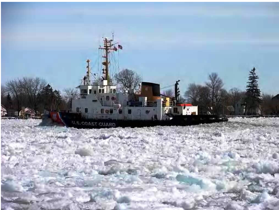
Penobscot Bay breaking ice on the St. Clair River