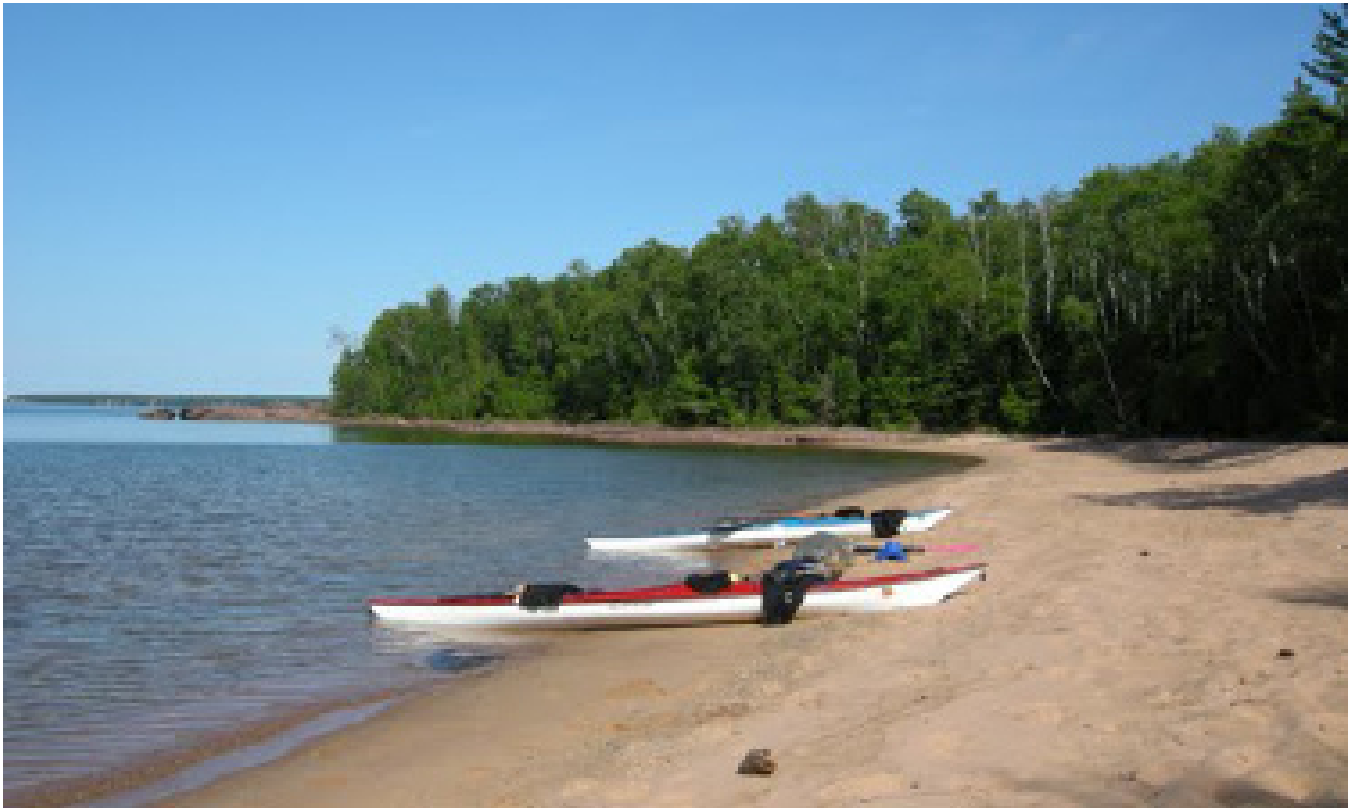
Sand Beach on Bear Island