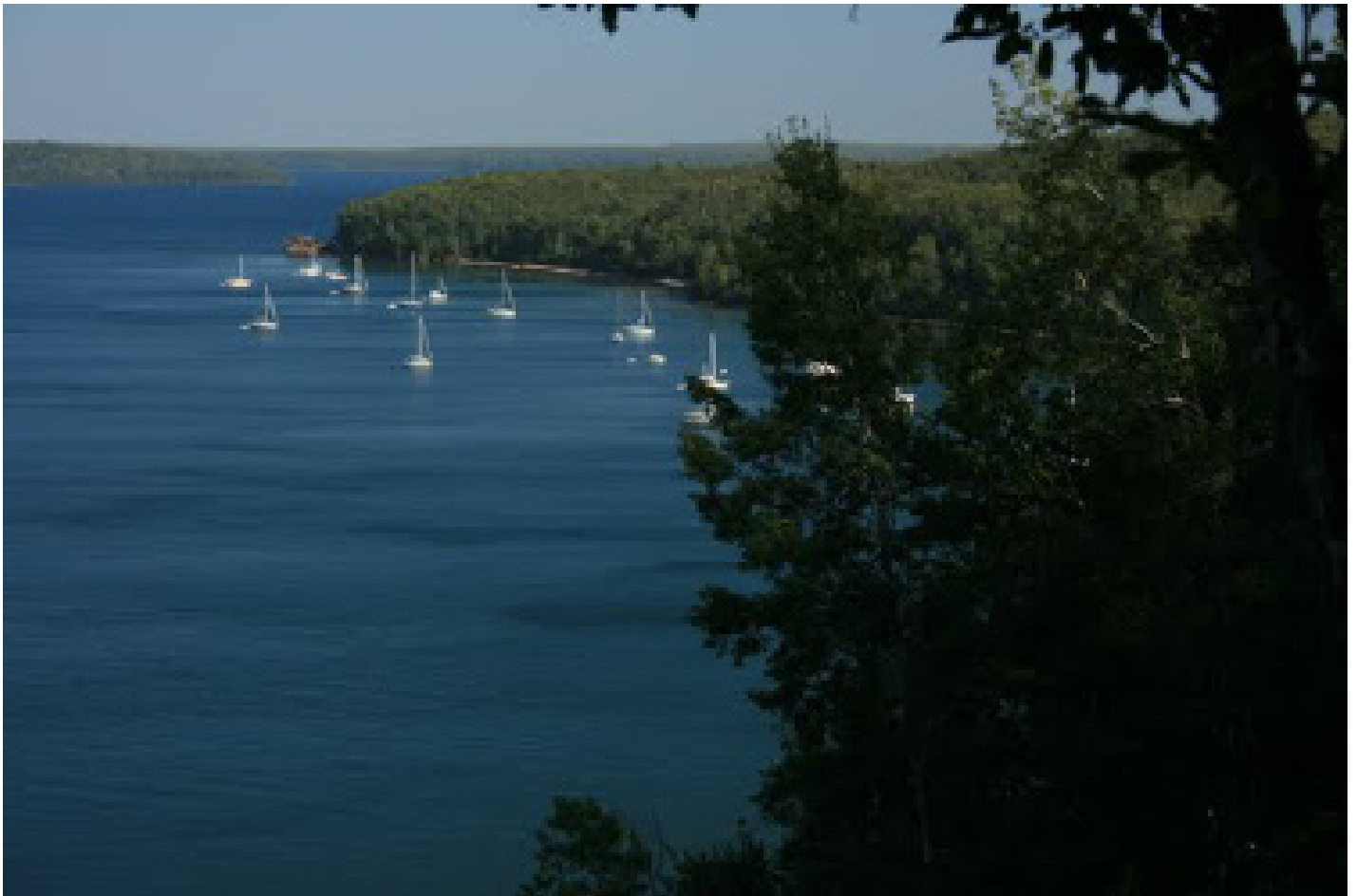
Oak Island overlook - view of anchorage - the hike starts in the center of the bay below at the campsite. It's pretty easy.