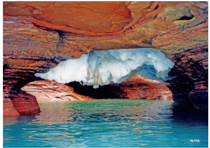
Beaches and Sea Cave in the Apostle Islands National Lakeshore, Wisconsin, northeast of Cornucopia, near Eagle Island. In June, some caves have hanging ice.