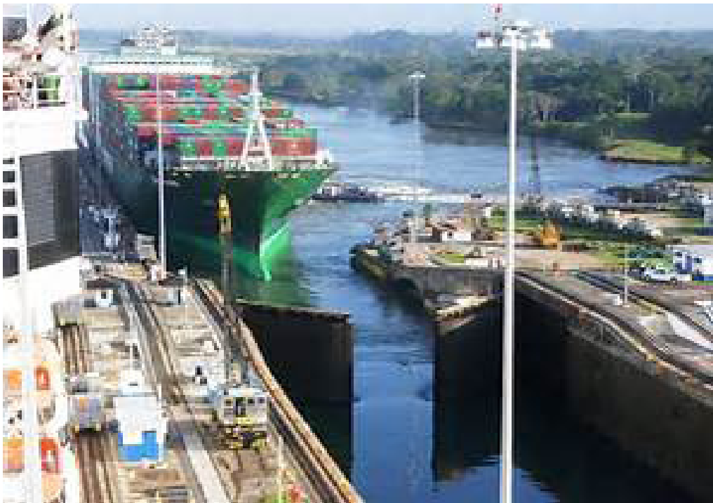
Gatun locks 3 Panama Canal