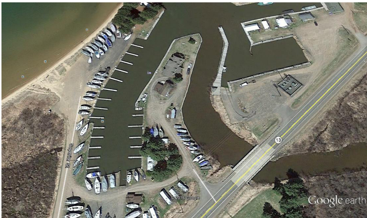
Marina and Launch ramp in Cornucopia Wisconsin on Siskiwit Bay