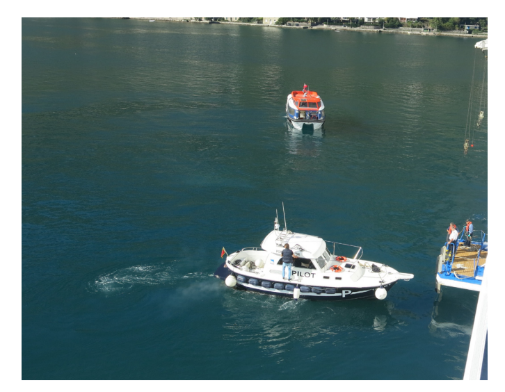
Pilot ready to jump aboard

We hope for a bitterly cold December! This means that the St. Clair River will freeze, requiring ice-breaking operations during the first 2 weeks in January before the shipping season closes for the winter, generally January 15th. The best place to find out if icebreakers are at work is the marine traffic website. If you see 140' bay-class icebreakers working in the River, drive to Algonac State Park along the river and watch the show. Take your marine scanner and listen on Channel 16 but be ready to change to Channel 6 to bridge-to-bridge conversations, sometimes a little heated. Watching icebreakers is actually noisy as they smash through the ice, trying to get a freighter unstuck.