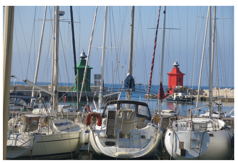
Red 'left' returning in Italy