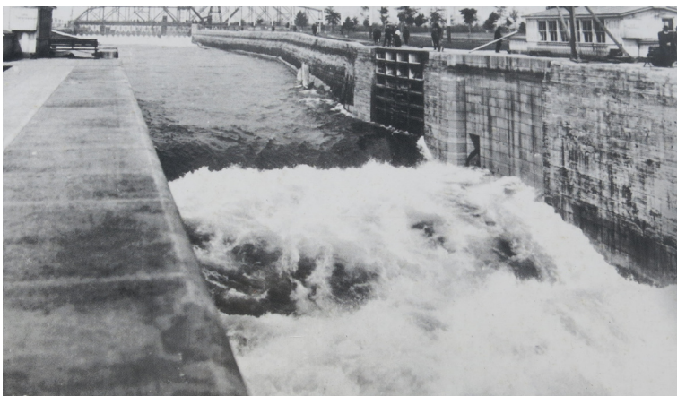
Damaged Lock at Sault Ste. Marie

One picture is a photograph of a mural by Parks Canada at the locks which shows the event with water running freely from Lake Superior into the St. Mary's River. The other is the Assiniboia from my own collection. However, no Great Lakes captain would ever need a tug in good weather; also a flag is never placed on the steering pole at the bow.