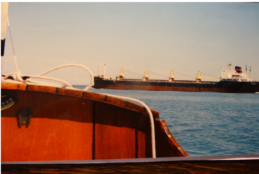
Soft Shoal meets a freighter at the south end of the St. Mary's River